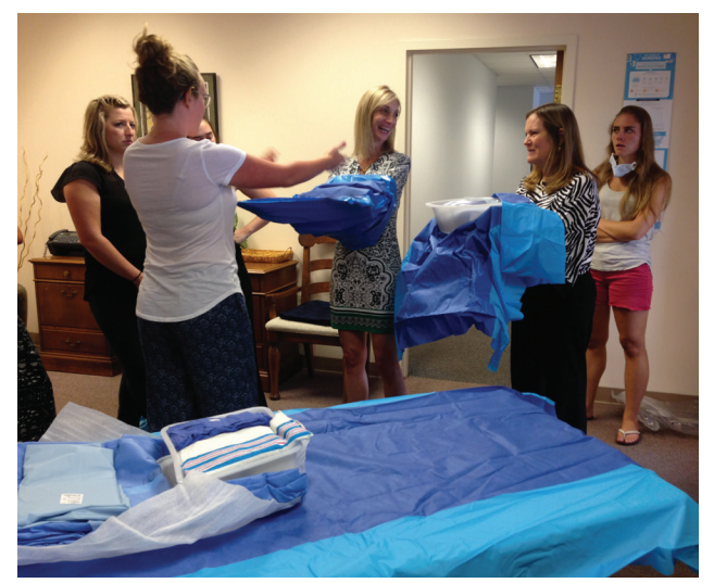
Transition to Practice L&D Program

Supporting the leader in the development and implemen-