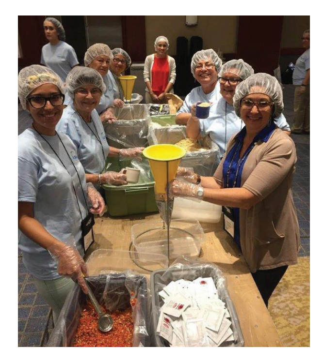
Mentoring Participants Preparing Food for Hungry at National Association for Hispanic Nurses Conference