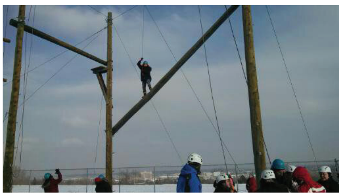
Building Skills for Effective Teams Ropes Course, Littleton, CO

National American University Northeastern Junior College Otero Junior College Pickens Technical College Pikes Peak Community College Platt College Pueblo Community College Regis University Southwest Colorado Community College Trinidad State Junior College UCCS Beth-El College of Nursing and Health Sciences University of Northern Colorado University of Phoenix