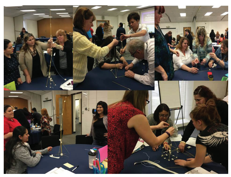
BSET Program Training Groups

self-regard and interest in seeking leadership positions upon completion and were promoted to leadership roles.