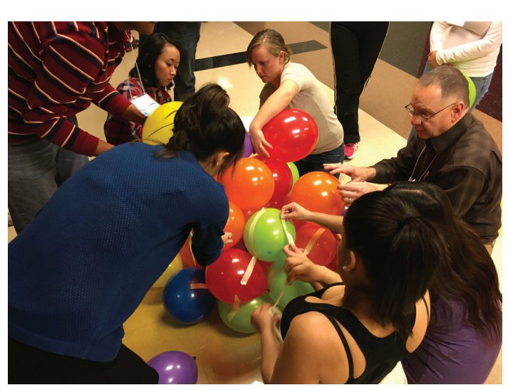
Balloon Exercise, BSET Peak Vista and Clinica Teams